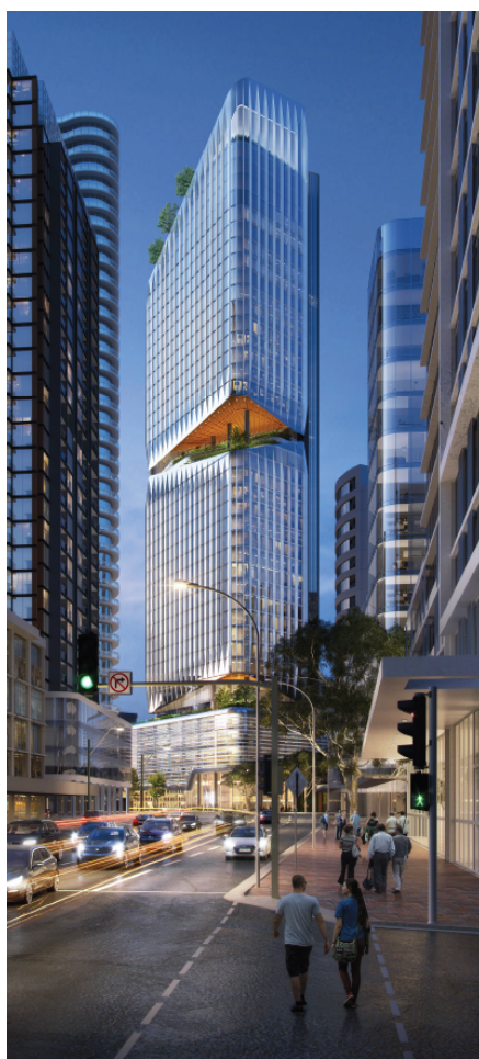
FIGURE 3: Artist's impression of the indicative concept design, viewed from the Pacific Highway, looking north-west – PP2/23 (Applicant's Urban Design Report)

The Planning Proposal is accompanied by an indicative concept scheme to demonstrate what could be achieved if the proposed amendments were implemented. The scheme includes a 42-storey commercial development with a part five-storey and part six-storey podium and 36-storey tower above; comprising 56,348 sqm of commercial office floor space; 408 sqm of retail floor space; and 128 car spaces over four basement levels (refer to Figure 3 below).