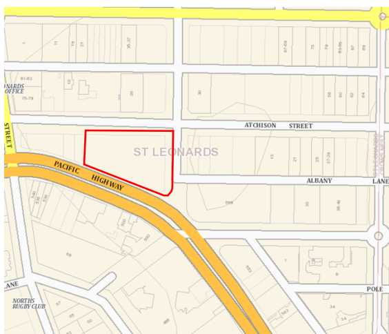
FIGURE 1: Subject Site

The site currently accommodates a 14-storey commercial office building with ground level retail uses, and 158 carparking spaces across four basement levels.